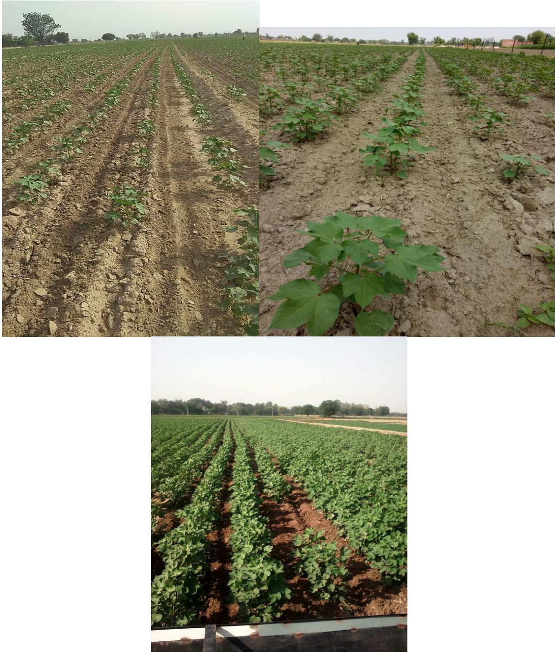
Figure 2: Effect of Biogenic silica/silica nanocomposites on – a) Vegetative growth of cotton crops; b) percent population of cotton boll worm b)